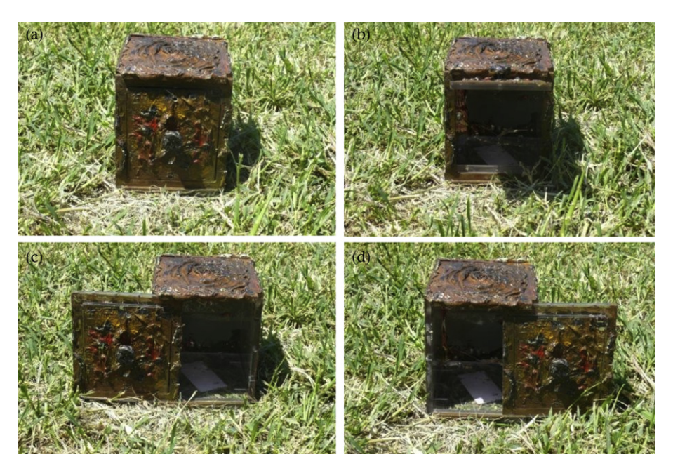
Figure 1. The 'vervetable': (a) door closed, (b) door lifted, (c) door slid to left, (d) door slid to right.

E. van de Waal et al. / Animal Behaviour xxx (2012) 1-6